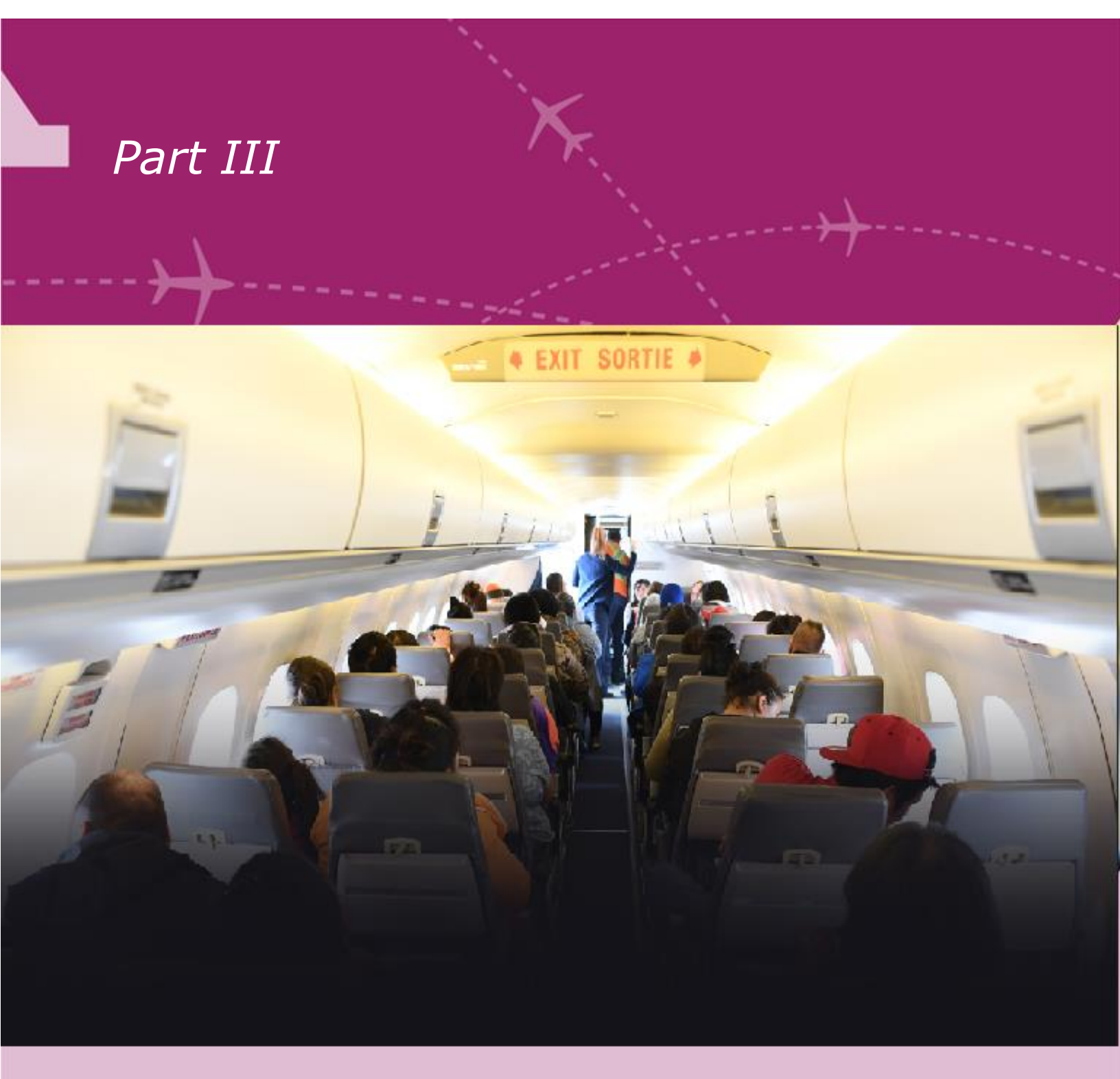
At the Airport/During Travel